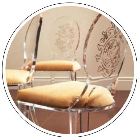
Acrylic framed chairs

Home décor seems to be about simplicity, so some trendsetters say. Because of this, natural