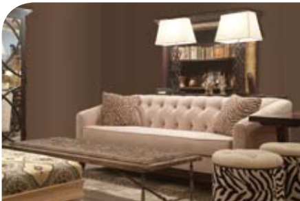
Peninsula Home Collection

Much like the inhabitants of our fair city, design trends in Las Vegas follow no hard rules. Depending on the builder's vision, we run from Mediterranean décor to chic city lofts. Tastes are eclectic but we seem to always hunger for something different to fill our fabulous living spaces. Las Vegas Design Center's February Market had a tremendous showcase of product especially perfect to embellish our local residences.