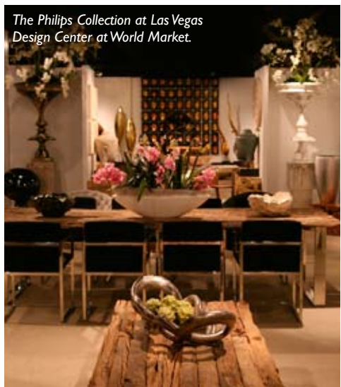
The Phillips Collection at Las Vegas Design Center at World Market.