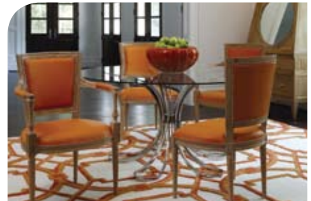
Global Views Showroom

A lofty look with a neutral palette—how can you go wrong? The clean look of a white interior brings on healthy slumber. A simple straight forward look with a twist, the leather headboard gives this room the interest it needs. Amisco's "My Design" program gives you access to a custom creation system where you can choose between 53 fabrics and 12 metal finishes and personalize your furniture.